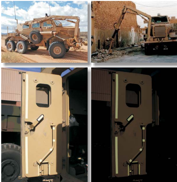
Left-rear door of Cat II Cougar shown for comparison.

When things go really bad and you've got to quickly orient yourself in a darkened vehicle and escape, clear and reliable safety and egress markings are vital.